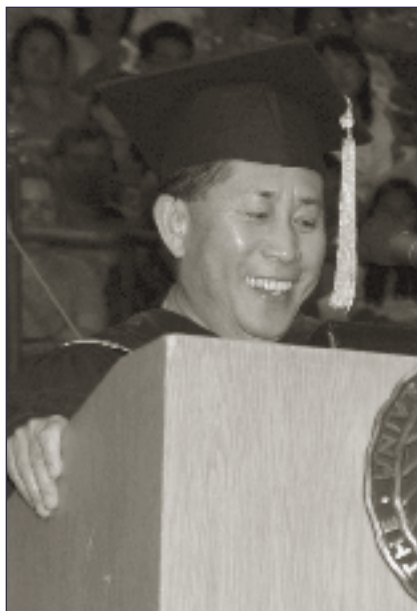
Bob Knight Photo