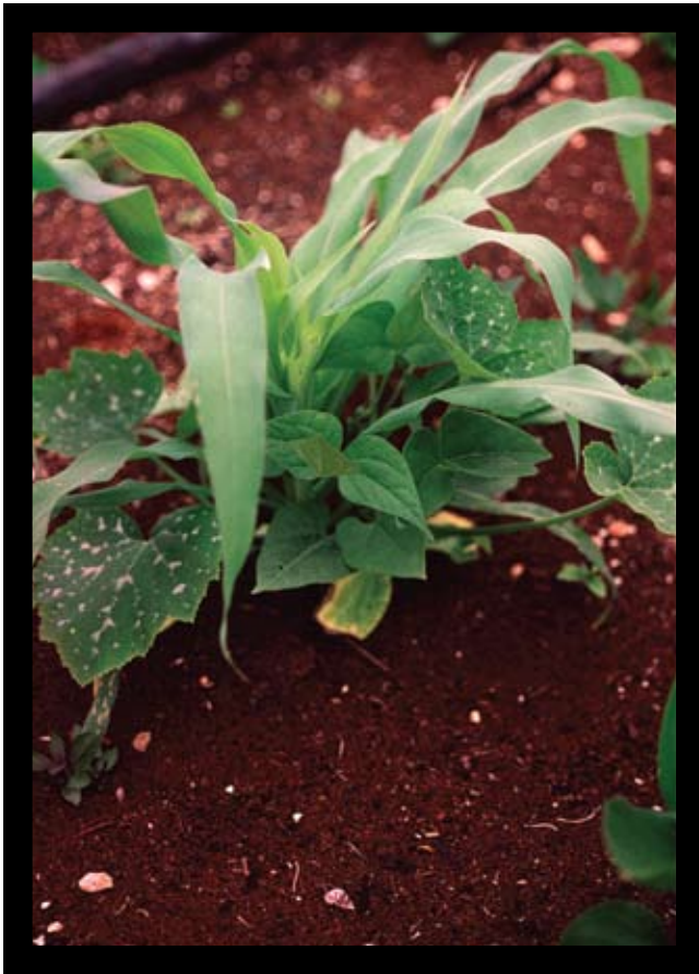
Latin American farmers began the practice of growing beans, corn, and squash together, a cropping system that has also been adopted by growers in Eastern Africa.