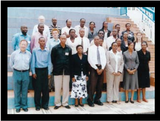
Professor Paul Gepts, bottom left, met with colleagues in Uganda for a plant breeding project that will enable East Africans to increase bean production using DNA marker-assisted selection.