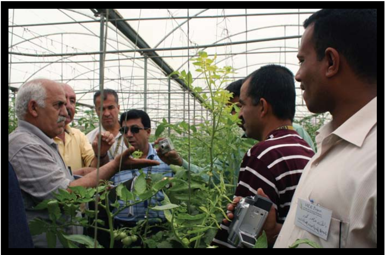
As part of an effort to revitalize agriculture in Iraq, agricultural educators visit a greenhouse to learn about a pest problem.

first part of the project (October 2006-September 2008), more than 100 Iraqi extension agents visited Jordan and Egypt—safe, neutral countries—to gain horticultural expertise from UC Davis scientists in crop production, postharvest technology, plant propagation and establishment, and pest, soil, and water management.