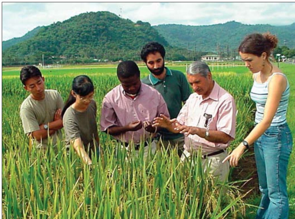
Rice varieties developed by Gurdev Khush (second from right) at the International Rice Research Institute in the Philippines have fed millions of people.

"Their passion for scientific inquiry inspired me, and I have fond memories of get-togethers at their homes and going on scientific outings with them."