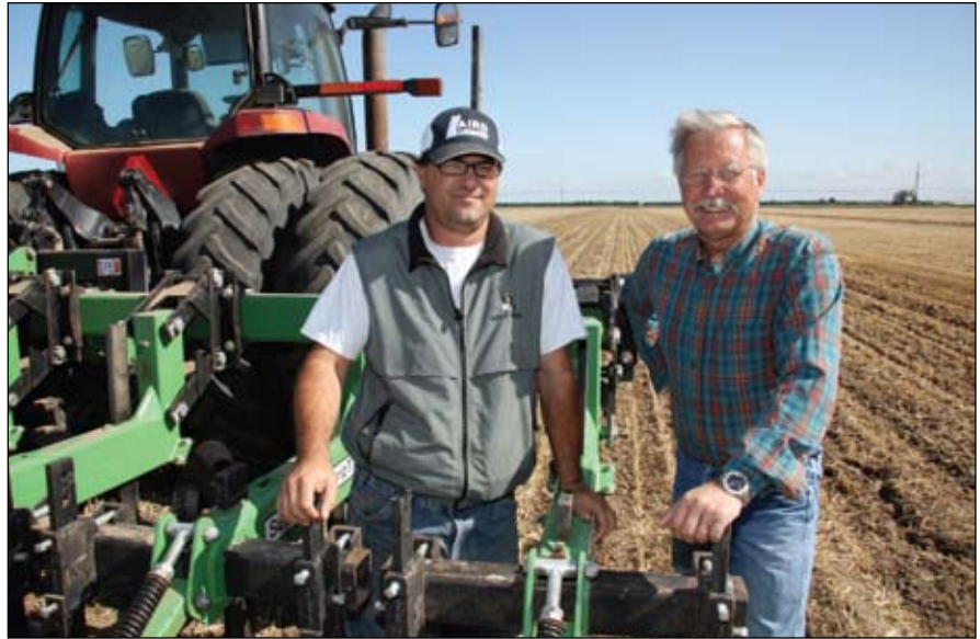
JOHN STUBBS/UC DAVIS

Conservation tillage is characterized by less tillage and fewer tractor passes across farm fields. In California it is evolving into a comprehensive approach that incorporates minimum soil disturbance, pres-