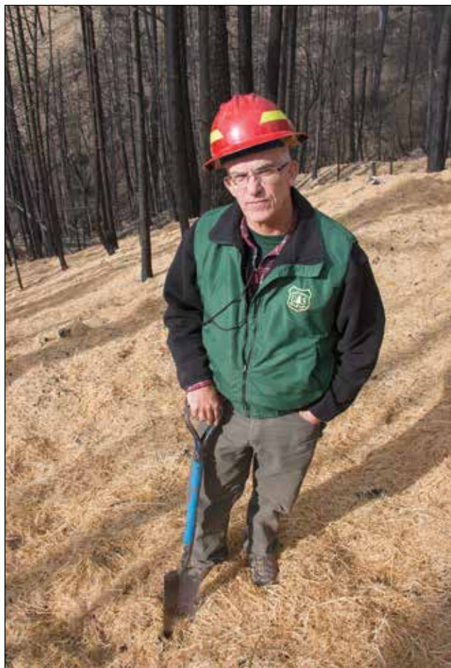
JOHN STUMBOS/JC DAVIS

The team prescribed treatments for about 4,000 acres to reduce the threat of soil erosion from winter